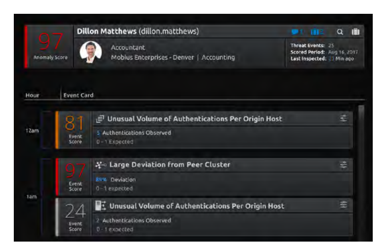
CloudAl's user timeline enables rapid investigation of user behavior and provides efficient workflows for further action.

Throughout the investigative workflow, CloudAI automatically presents identity information from Windows Active Directory. It allows immediate access to underlying log and event data, which can be saved to an associated case with a single click. These integrated capabilities support the TLM workflow, improving analyst productivity and accelerating incident response.