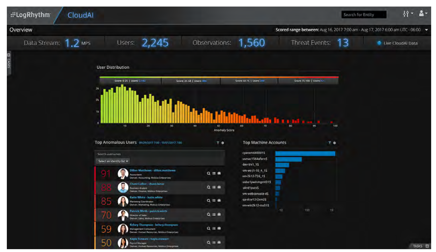
CloudAl's user activity dashboard enables monitoring of potentially risky users and machine accounts and provides immediate drill-down to the anomalous entity.